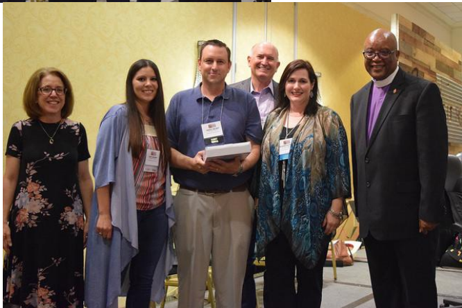
One Matters Awards (from top) - First UMC Aztec, First UMC Carlsbad, Crane UMC