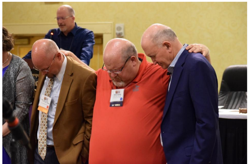
2020 General and Jurisdictional Conference Delegates