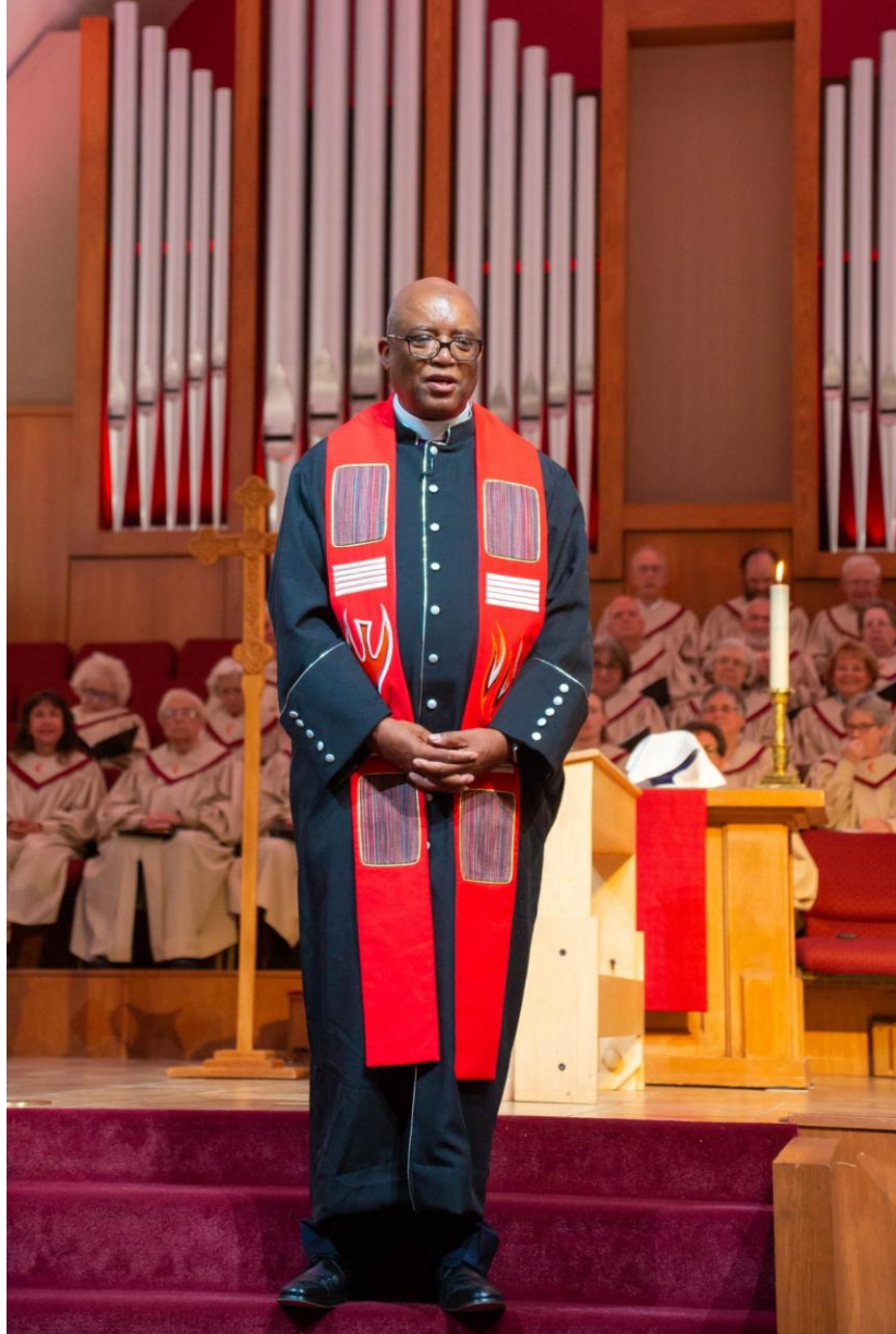
Bishop W. Earl Bledsoe

Presiding Bishop of The New Mexico Annual Conference