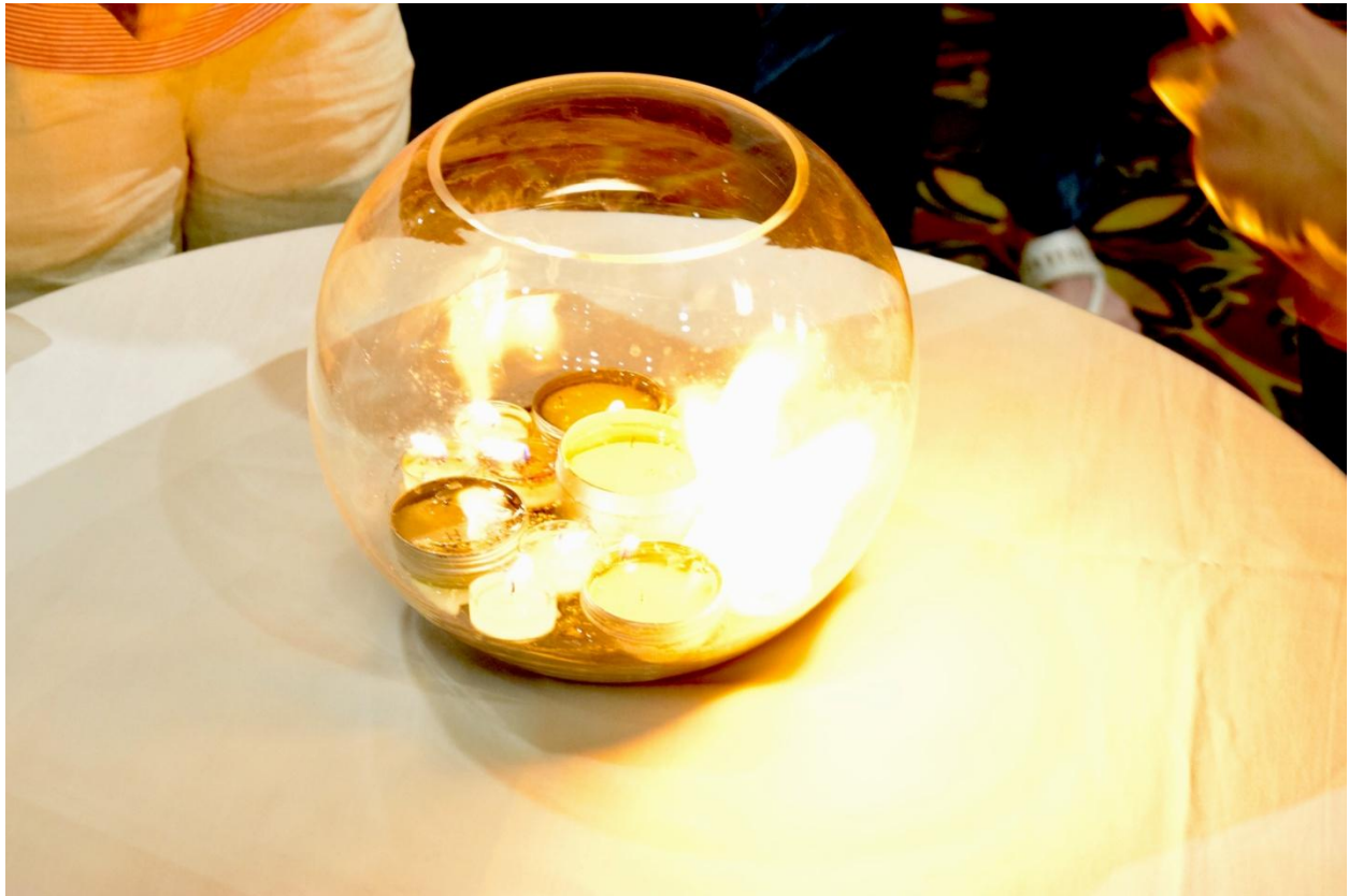
Burning Our Dross