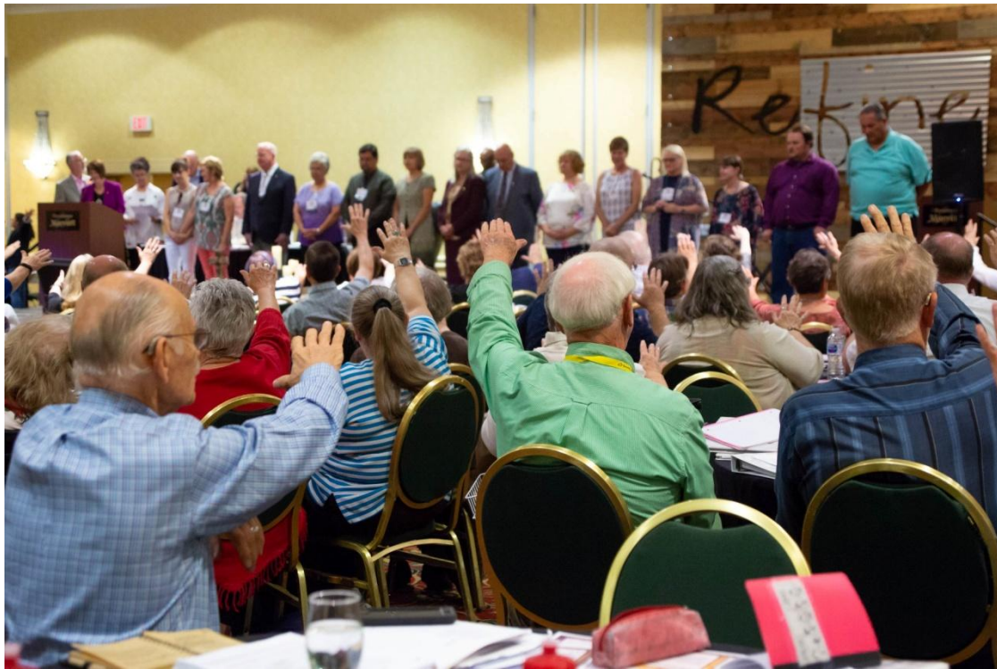
Praying for our CLMs