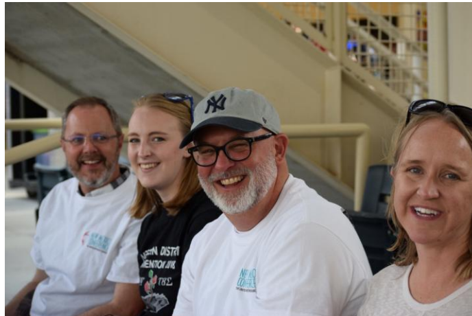
United Methodist Night at Isotopes Park!

of the home, including furnishings and appurtenances (such as a garage), plus the cost of utilities in such year.