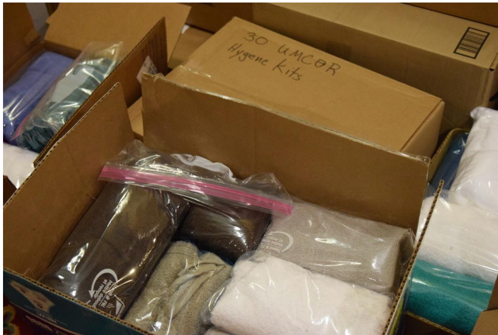
Over 700 Hygiene Kits were assembled for UMCOR!