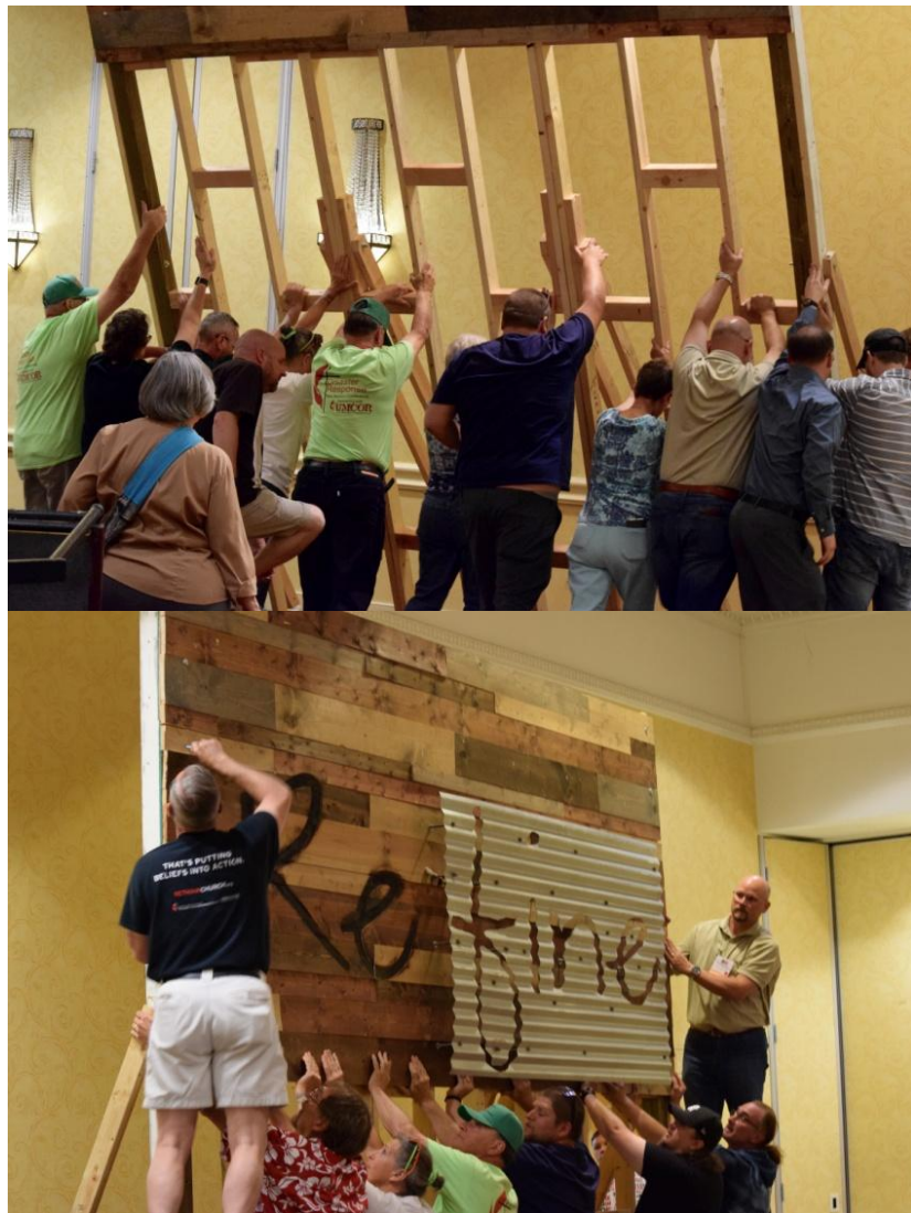
It took a village...