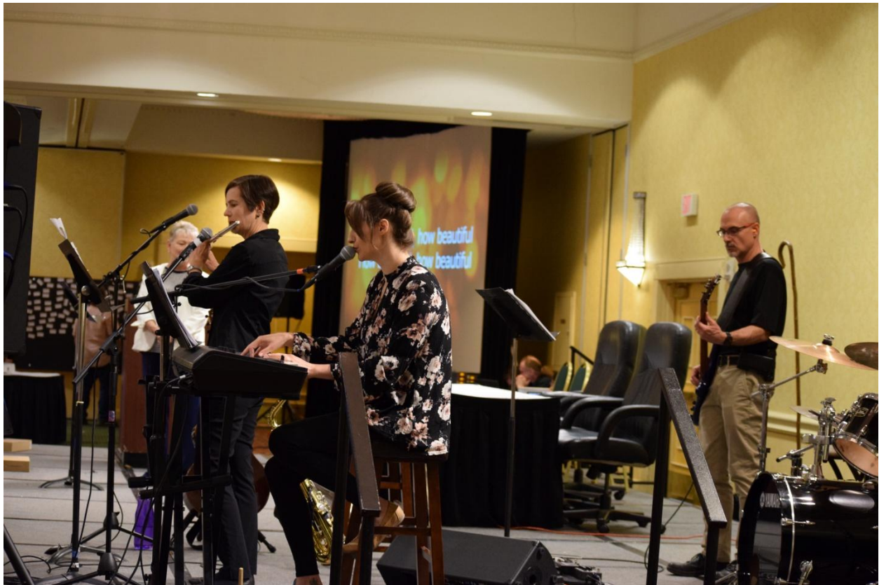
The Rock and Roll Jesus Train

THEREFORE, BE IT RESOLVED that we go now to dream big, Just Say Yes, dig deep into ministry, receive our new pastors, say good bye to our retirees, and say 'Vaya Con Dios' until we reconvene back here in Albuquerque in 2019.