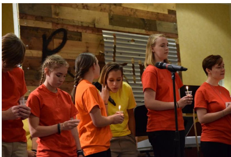
A message from our youth