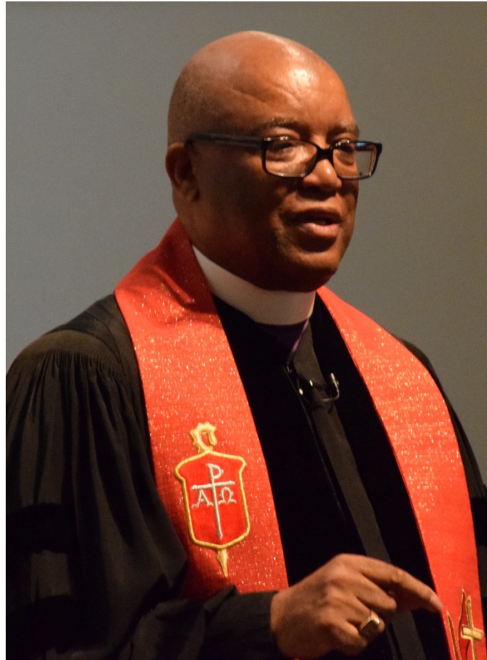
Bishop W. Earl Bledsoe Presiding Bishop of The New Mexico Annual Conference