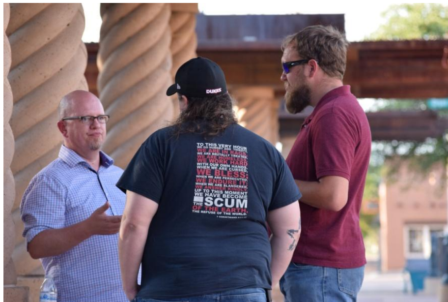
Food Trucks and Fellowship on the Plaza