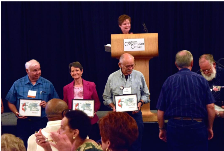
Cinco Estrellas Awards