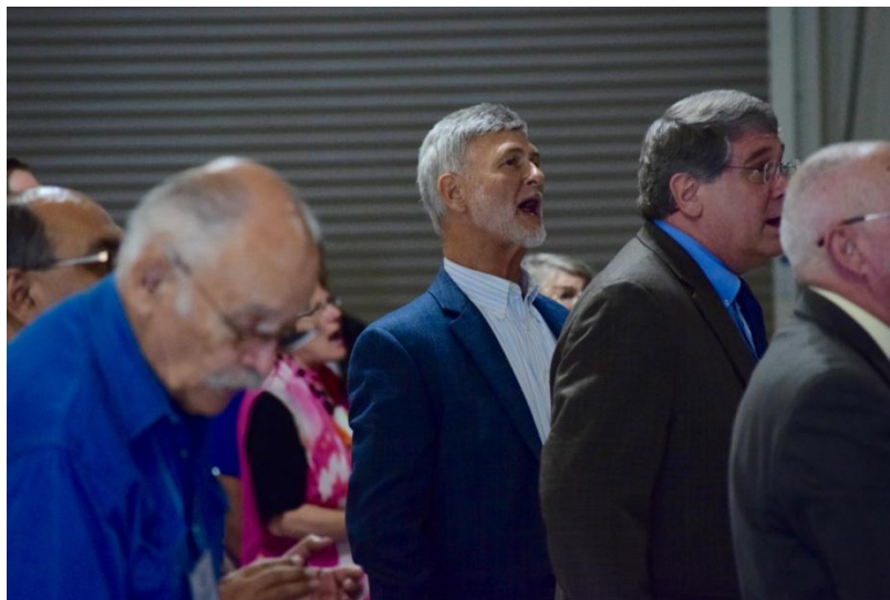
Methodists are a singing people!