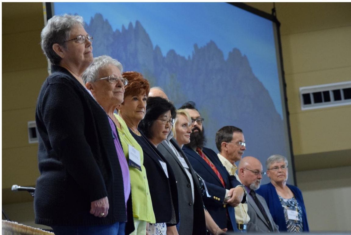
The 2017 Class of Certified Lay Ministers