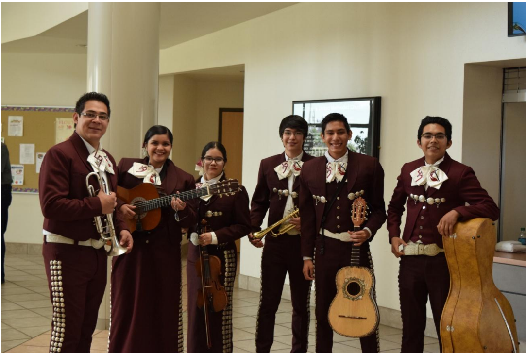
The Mariachis of Lydia Patterson Institute