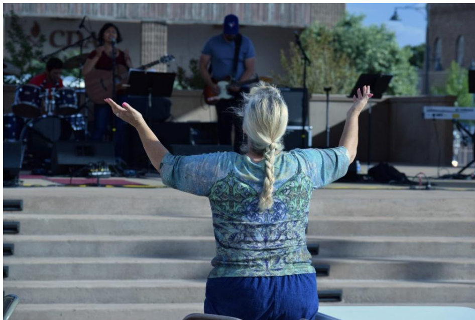
Praise on the Plaza

(iii) NOTE: The rental/housing allowance that may be excluded from a clergyperson's gross income in any year for federal income tax purposes is limited under Internal Revenue Code Section 107(2) and regulations there under to the least of: (1) the amount of the rental/housing allowance designated by the clergyperson's employer or other appropriate body of the church (such as this conference in the foregoing resolutions) for such year; (2) the amount actually expended by the clergyperson to rent or provide a home in such year; or (3) the fair rental value of the home, including furnishings and appurtenances (such as a garage), plus the cost of utilities in such year.