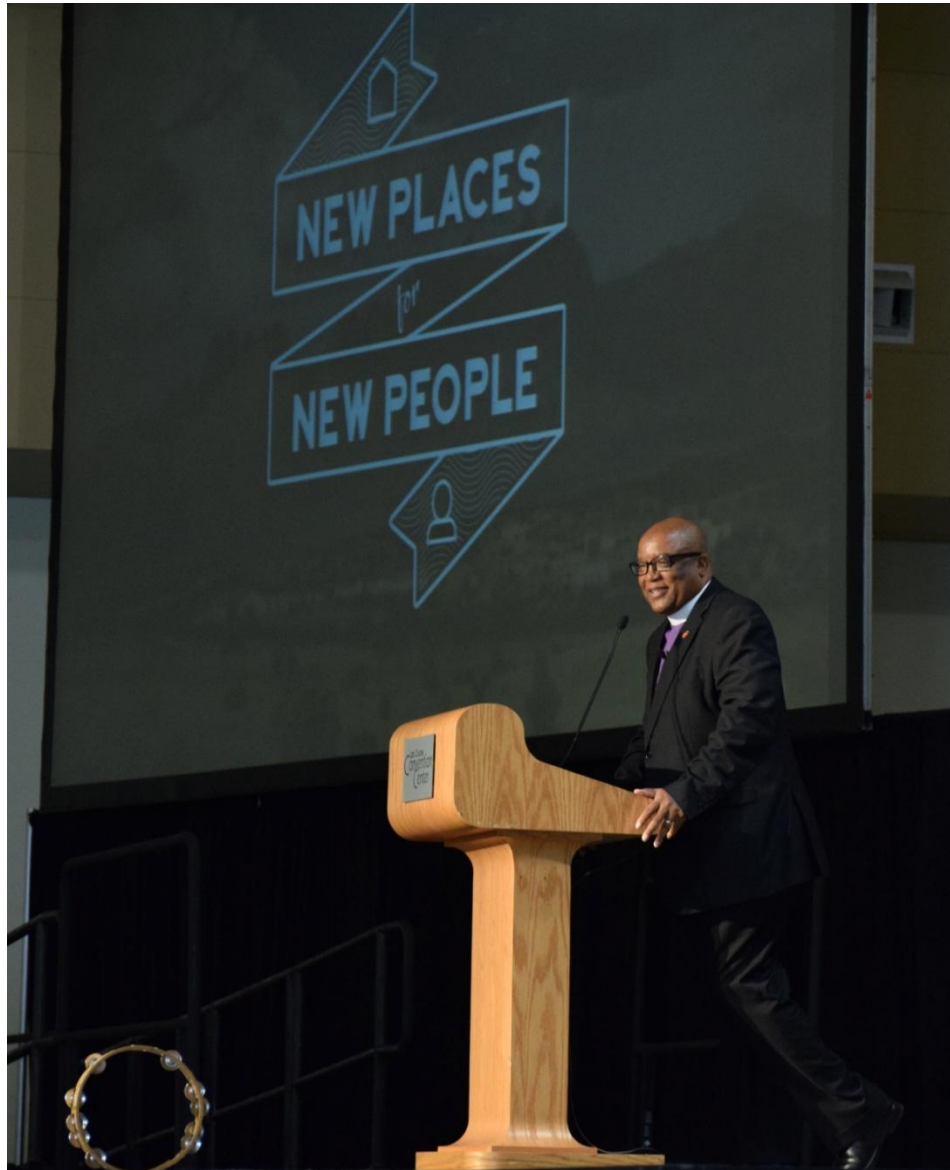
Bishop W. Earl Bledsoe Presiding Bishop of The New Mexico Annual Conference