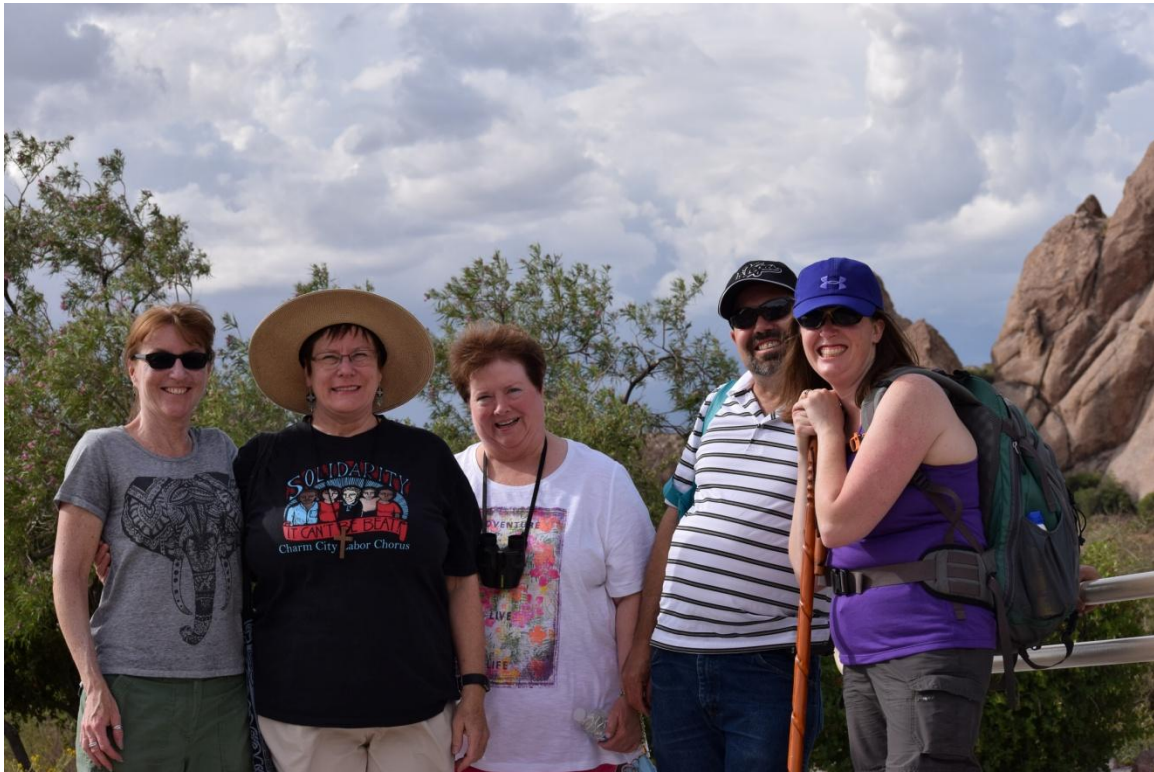
Worshipping in the Wilderness - Dripping Springs