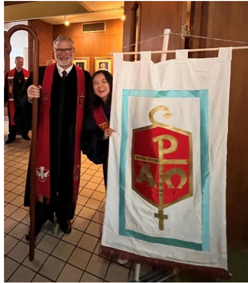
Ready for the processional!