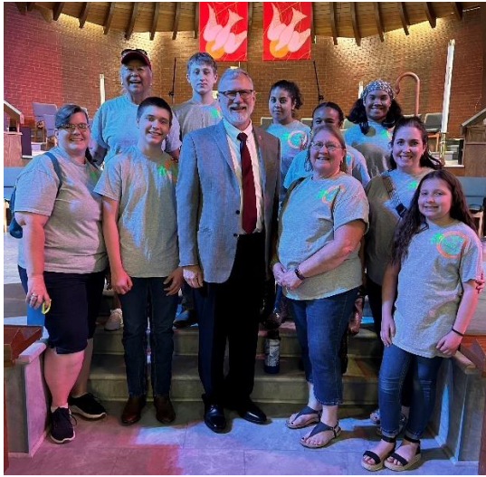
Rio Rancho UMC Youth and Bishop Schnase