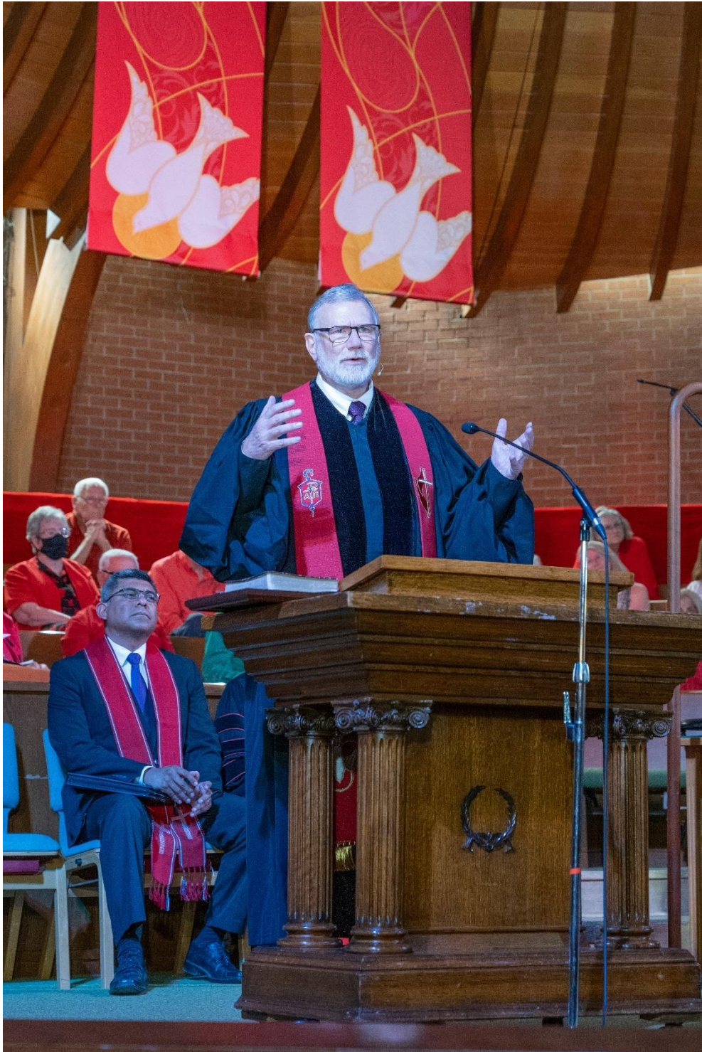
Bishop Robert Schnase Presiding Bishop of The New Mexico Annual Conference