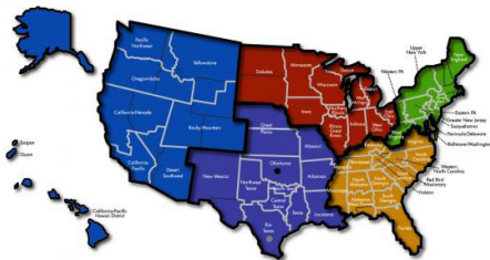
United Methodist Jurisdictions and Annual Conferences in the U.S.

The petition would establish a new U.S. Regional Conference for governance of U.S.-only matters. GC delegates from across the worldwide UMC would no longer need to vote on petitions that affect only people who live, worship and minister in the U.S.