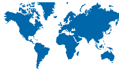
National/Episcopal Governance: Adaptable, Local Matters