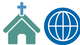
General Conference: Connectional Matters