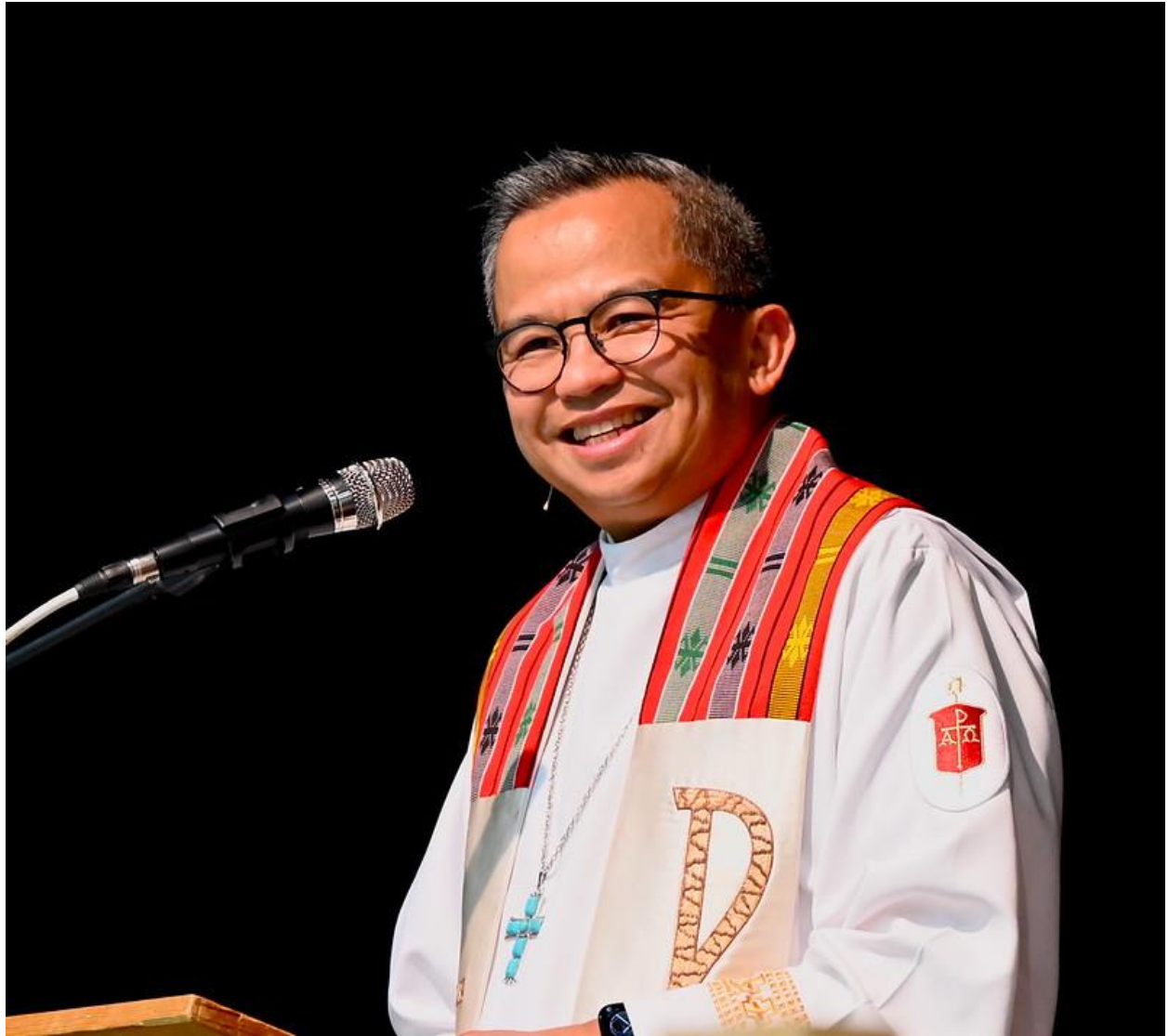
Bishop Carlo A. Rapanut Presiding Bishop of The New Mexico Annual Conference